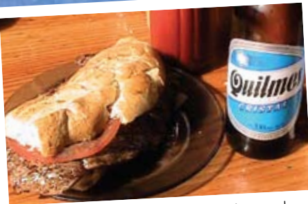
LOMITO world's best steak sambo